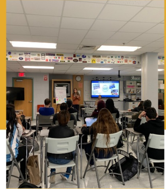
Build Intentional Space within our Community - Bridge