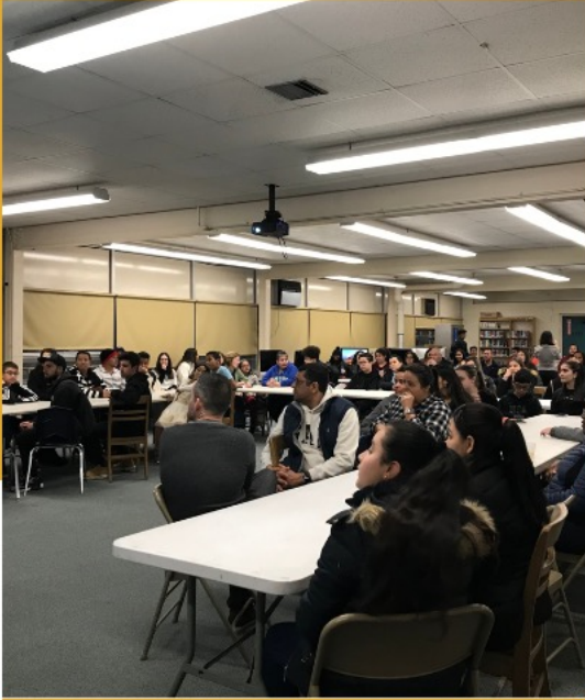
Family Enrollment - Intentional