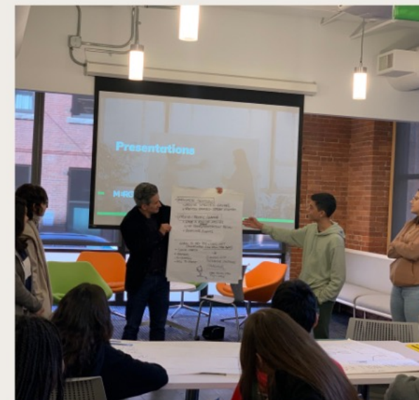
Near peer TA in each room

Wrap-around support: tutoring, homework help group, reminders, phone calls.